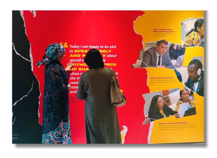
SRSG-SVC Patten guiding Deputy-Secretary-General Amina Mohammed around the exhibition