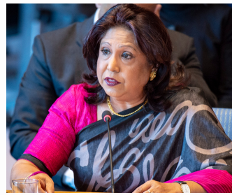
Special Representative of the Secretary-General on Sexual Violence in Conflict and Under Secretary-General, Ms. Pramila Patten

"Although it is a crime as old as war itself, conflict-related sexual violence is preventable. It is not an inevitable by-product of war. It is never an accident. Though many conflicts are characterized by widespread sexual violence, not all are. We can and must prevent it."