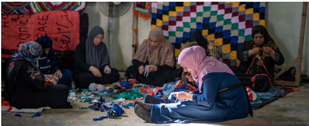
This photo is for the purpose of illustration only. Persons featured in the photo are not necessarily survivors of CRSV.

In order to support the two operational arms of the CRSV mandate, two Windows were established under the CRSV-MPTF – one for the UN Action Network and the other for the Team of Experts (TOE) on the Rule of Law and Sexual Violence in Conflict 3,4 . This report covers initiatives funded through the UN Action Window of the CRSV-MPTF 5 .