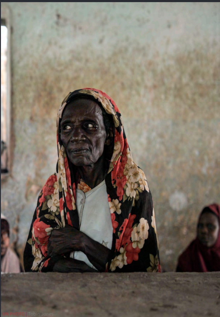
This photo is for the purpose of illustration only. Persons featured in the photo are not necessarily survivors of CRSV.

This Report provides an overview of the key initiatives and achievements of the UN Action Network from 1st January 2020 to 31st December 2020, as they relate to deliverables specified in UN Action's Strategic Framework for 2020 – 2025 , and its attending 2020-2021 Workplan. This includes activities funded through the UN Action Window of the Conflict-Related Sexual Violence Multi-Partner Trust Fund (CRSV-MPTF) .