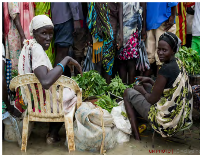
This photo is for the purpose of illustration only. Persons featured in the photo are not necessarily survivors of CRSV.

In early 2020, the UN Action Network convened to articulate a new goal, develop its 2020 – 2025 Strategic Framework, and attending governance and planning documents which are detailed further in this report.