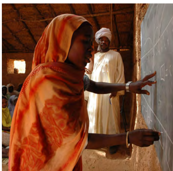
This photo is for the purpose of illustration only. Persons featured in the photo are not necessarily survivors of CRSV.