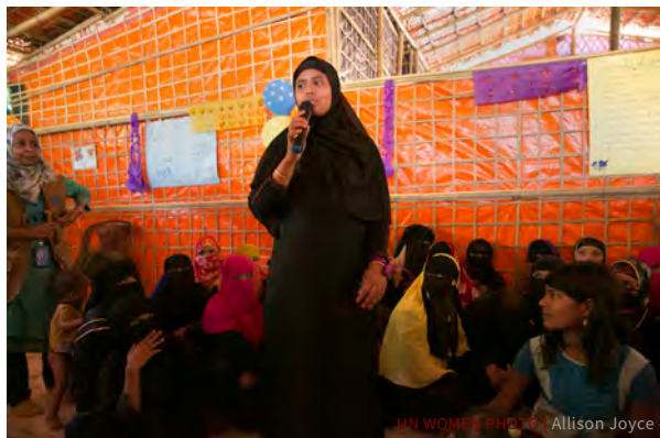
This photo is for the purpose of illustration only. Persons featured in the photo are not necessarily survivors of CRSV.

Reinforced by Security Council resolution 2467 (2019), going forward, UN Action has re-committed to ensuring all initiatives are framed through a survivor-centred approach in preventing and responding to CRSV, and focusing on supporting the long-term resilience of survivors. As the UN's knowledge-generation hub on CRSV, UN Action has initiated the development of guiding principles for a survivor-centred approach in preventing and responding to CRSV, building on existing guidance within the human rights and humanitarian sectors.