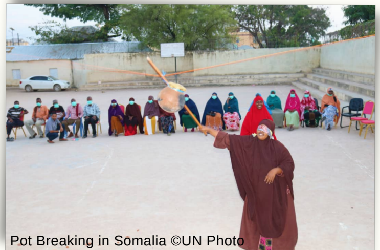
Pot Breaking in Somalia

IOM Somalia supports the implementation of cultural and art-based activities that positively impact the social cohesion and improve the collective psychosocial wellbeing in Somali communities.