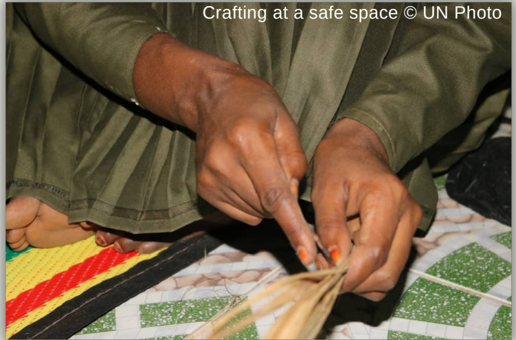
Crafting at a safe space

For Ghada, the efforts to eliminate CRSV need to be guided by the experience, interests and needs of survivors through a survivor-centred approach. In this regard, “Putting the survivors at the heart of our actions, we will be guided by their experiences, and we’ll be in the right direction to get their needs in the heart of everything that we are doing”.