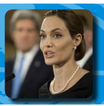
London conference on Missolviolence Against Women SRS and Children in Emergencies, organised in London by the United Kingdom's

Department for International Development 13 November 2013