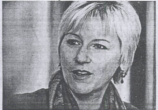
Margot Wallström, the UN Secretary-General's Special Representative on Sexual Violence in Conflict

The Conference in December is about reviewing the whole spectrum of Sierra Leone's development as a nation since independence and determining where we want to be in the next 25-50 years and how best to get there without the pitfalls of the past.