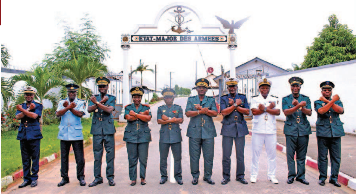
UNFPA Côte d'Ivoire Country Office

GBVIMS Steering Committee activities and GBVIMS rollout sites.