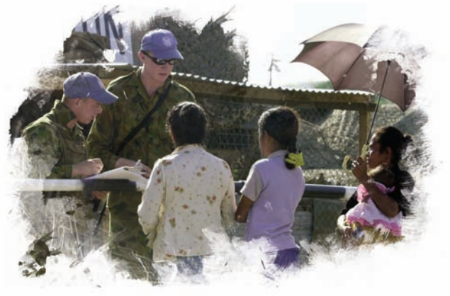
East Timorese women speaking to peacekeepers providing security at the border.

The roll-out and distribution of this knowledge product, financed by the Government of Australia, will include the development of training material as part of a package being developed by DPKO Integrated Training Service (ITS) on the protection of civilians. There will also be continuing capture of the kinds of tactics identified in this paper to build a "bank" of good practice. Indeed, since this process began, there has been a virtuous cycle of increased attention to sexual violence leading to more concerted efforts on the ground.