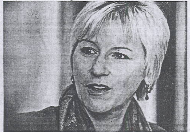
Margot Wallström, the UN Secretary-General's Special Representative on Sexual Violence in Conflict

ernment alone but it should be seen as a national effort that will outlive succeeding governments. The market women were unanimous in stating that they will like to see a Sierra Leone where "our natural resources are well managed, education is given a priority, there is free health care for all, factories are constructed to provide job opportunities for Sierra Leoneans, there is abundance foreign exchange and the country is food sufficient among others." They pledged to put in writing a position paper that will be presented to the Secretariat as part of their input to the Conference. The Conference in December is about reviewing the whole spectrum of Sierra Leone's development as a nation since independence and determining where we want to be in the next 25-50 years and how best to get there without the pitfalls of the past.